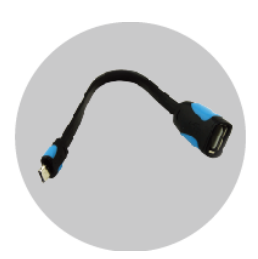
OTG cable (OTG-12CM) Connect the controller to mobile APP