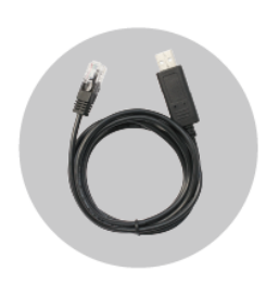
Communication cable CC-USB-RS485-150U USB to RS485 PC communication cable (1.5m)